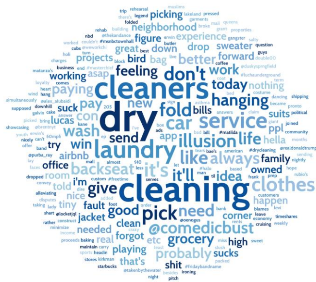
Dry Cleaning Category Analysis (Chi... — Words from 3/6/16 to 4/5/16

Finally, additional tools should be utilized such as Crimson Hexagon to better analyze and interpret secondary research involving Pressbox itself as well as the broader dry cleaning and app-related industries. For example, the word cloud below was assembled using Crimson Hexagon.